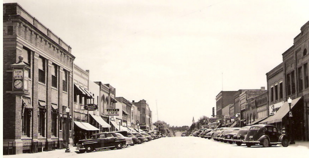
MAIN STREET, HARTINGTON, NEBR.

The Hartington Downtown Historic District is listed in the National Register of Historic Places under Criterion A for its association with the town's role as an important regional commercial center. The district is significant at the local level and contains 30 contributing resources, in addition to two resources already listed in the National Register. Most of the buildings within the district boundaries were constructed to provide retail, banking, and service in support of the local and regional population. This is a role many of the buildings still fill. The importance of the town as a regional center was reinforced by the fact that it was established as a stop along the Chicago, St. Paul, Minneapolis & Omaha Railroad (Omaha Road) and quickly became the Cedar County seat. The period of significance extends from 1900 to 1969.