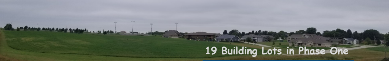
19 Building Lots in Phase One

Subdivision entrance is at the corner of Darlene Street and Cornell Avenue.